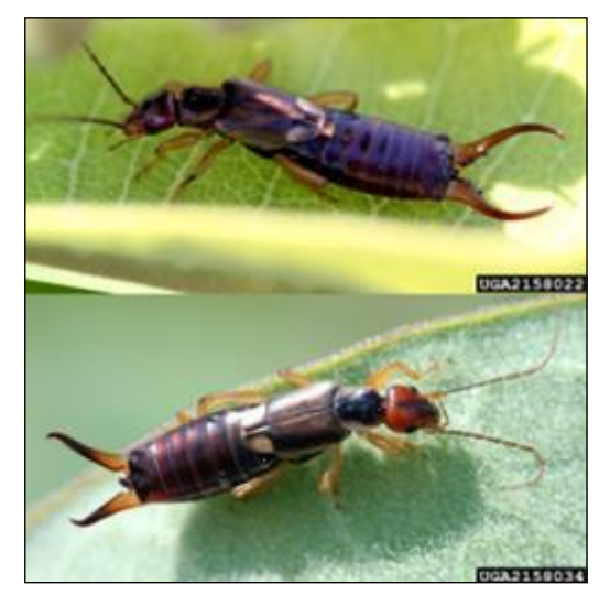
Top photo is a male earwig, bottom is the female.

Earwigs are attracted to excess moisture. So be sure to your landscape and garden have good drainage. As the season progresses and you irrigate, be sure to water more thoroughly and deeply but less often so the surface of the soil remains drier.